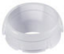
N3C-D2 / Opal Diffuser Cap This cap diffuses the LED light.