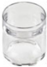
N3C-L / Long Cap This cap is useful to adjust the working focus of Dino-Lite Edge at lower magnification.