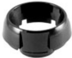
N3C-S / Sidelight Cap This cap creates images with more depth and texture.