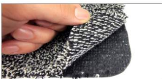
Normal Mats and Rugs

The ' MicroMagic ' mat is perfect to clean pet feet.