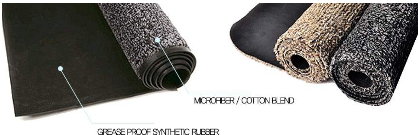
COMMERCIAL(LEFT), HOME(RIGHT) MAGIC CLEAN MAT