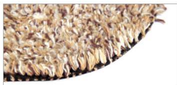
The ' MicroMagic ' Mat