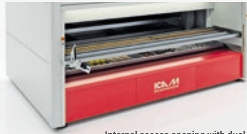
Internal access opening with dual level delivery