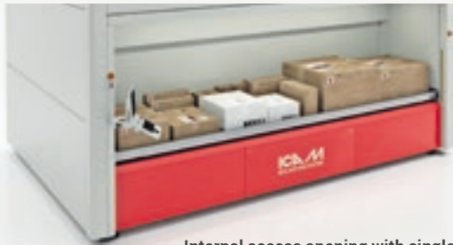
Internal access opening with single tray delivery

The dual level delivery , meanwhile, provides increased operational efficiency for storage and retrieval operations: while the operator stores and retrieves items on the first level, the internal vertical shift system continues working on the next handling operation, bringing it to the second level, therefore significantly reducing waiting times for the warehouse operator.