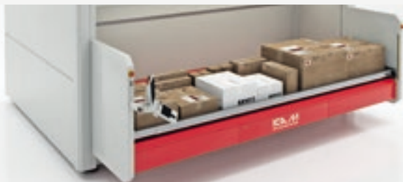
External access opening with single tray delivery