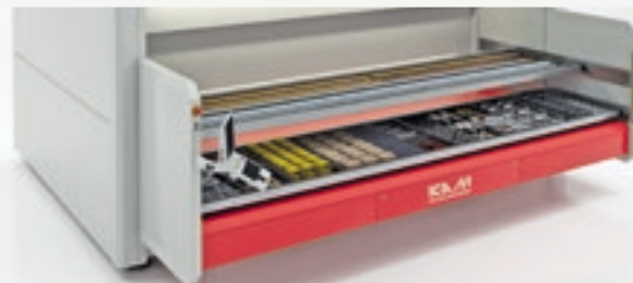
External access opening with dual level delivery