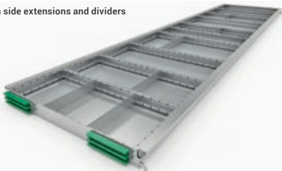
Tray with side extensions and dividers