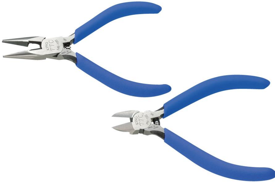
MR-100 Long Nose Pliers

(MR-100 Long Nose Pliers Spring / PN-100 Plastic cutter Spring)